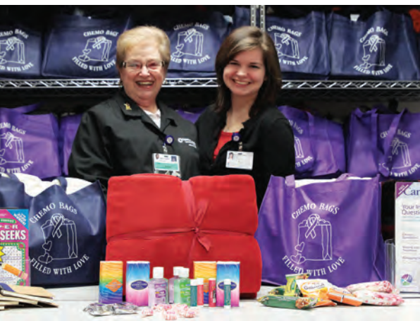
Volunteers assemble Chemo Bags Filled with Love.

The bags are free thanks to funding provided by donors to the Salem Hospital Foundation. During 2013, the Foundation granted close to $6,000 to the chemo bags project. Each month volunteers assemble approximately 40 bags.